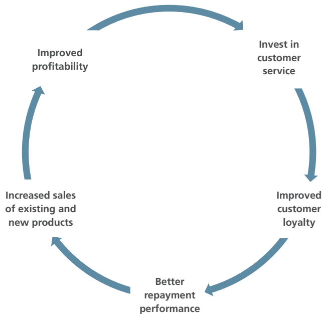
Figure 3 The virtuous circle of improved customer service in specialist lending